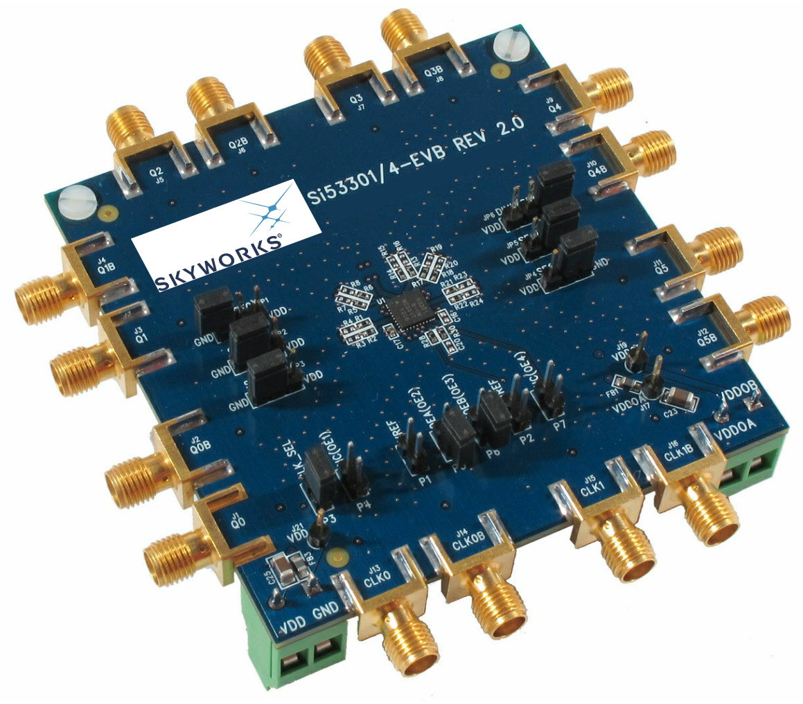
Figure 1. Si53301/4 Evaluation Board