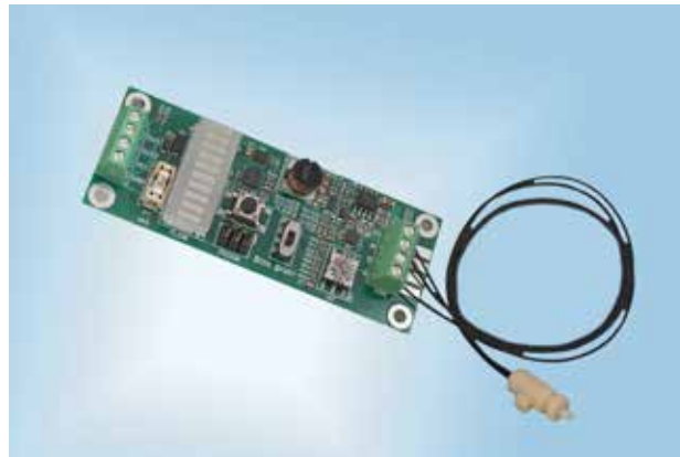
Board with FS sensor (example)