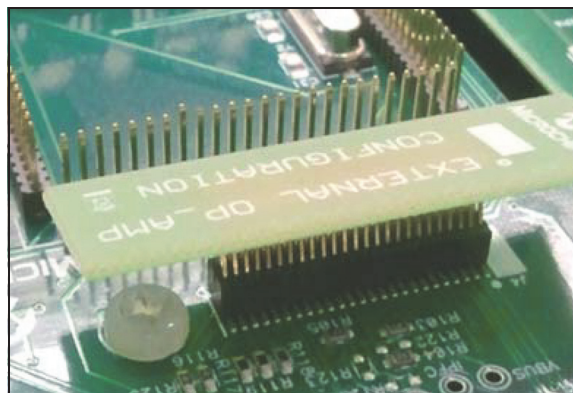
FIGURE 2: EXTERNAL OP AMP CONFIGURATION BOARD

Table 1 provides information on the hardware versions of the motor control boards that are compatible with this PIM. Refer to the user's guide of the specific motor control board to find information related to hardware version identification.