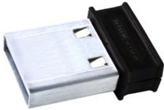
Figure 1: BLED112 Bluetooth Low Energy USB dongle

BLED112 Bluetooth Low Energy Dongle integrates all Bluetooth Low Energy features. The USB dongle can a virtual COM port that enables simple host application development using a simple application programming interface. The BLED112 can be used for Bluetooth Low Energy development. With two BLED112 dongles you can quickly prototype new Bluetooth Low Energy application profiles by utilizing Bluegiga Profile Toolkit™ and also automate in module software functions with Bluegiga BGScript™.