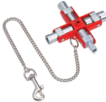
00 11 06