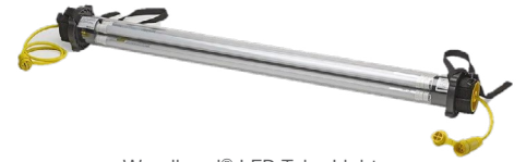
Woodhead® LED Tube Light

Improving on the extremely durable tube light design, the Woodhead® LED Tube Light replaces fluorescent lamps with LED's to boost reliability, efficiency and lamp life