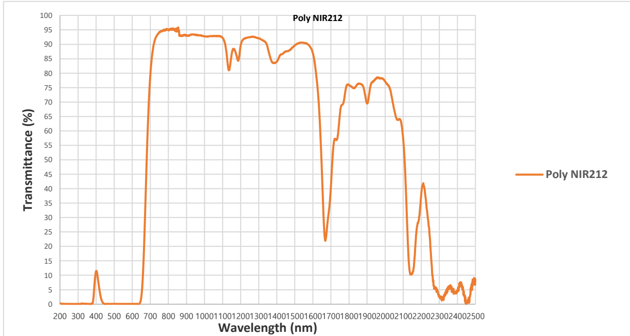
(Graph2 – Transmittance of NIR(near infrared) material)